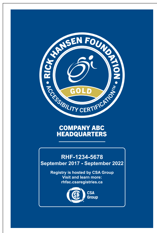
Above: Example of label design.