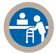
Interior Services and Environment