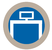
Additional Use of Space