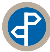
Signage, Wayfinding and Communications